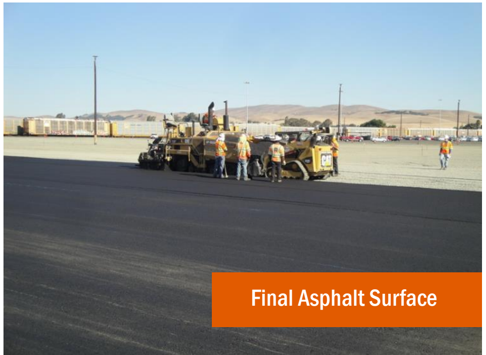
Final Asphalt Surface