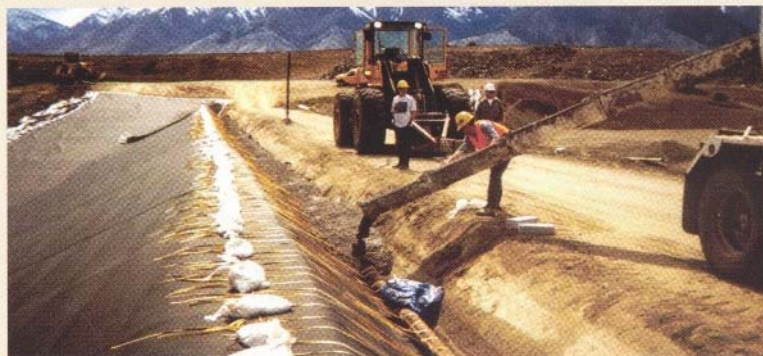
Photo 3: With the high-strength tendons secured to a crest anchor pipe, the trench is filled with concrete prior to securing the geocell sections to the trailing tendon ends.

Kevlar ® (aramid) tendons with a minimum break strength of 13.34 kN (3,000 lbf.) were threaded through predrilled holes in the geocell sections. Restraint clips were attached to the tendons in designated cells according to the design. To ensure the preassembled panels would match the required length when deployed on the slope, the sections' outer edges were stretched and placed over perimeter stakes.