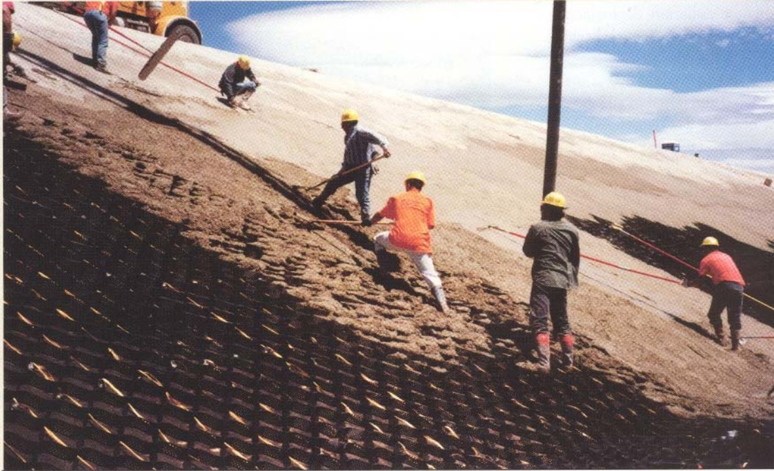
Photo 4: Concrete with a 3/8-in. pea gravel aggregate mix was placed in the open cells of the geocell sections and distributed evenly by workers positioned on the face of the slope.

In total, 8,360 m 2 (90,000 ft. 2 ) of liner material and more than 100 sections, or 5,574 m 2 (60,000 ft. 2 ), of geocell material and more than 382 m 3 (500 yd 3 ) of concrete were used to protect the dam face at Mud Lake Dam.