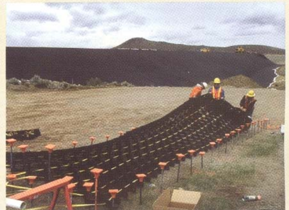
Photo 2: The tendons and restraint clips were integrated in the geocell panels at a fabrication area and carried to the slope for deployment.

The second layer was a 45-mil reinforced polypropylene geomembrane. Custom panels were fabricated to size with staggered panels to account for length differential along the face of the dam.