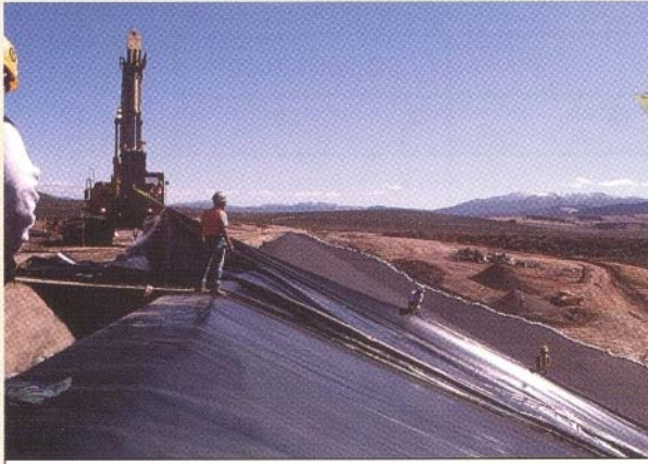
Photo 1: The protective geomembrane layer was placed over a geotextile on the dam face and the vertical seams were field-welded.

Situated at the base of the United States' picturesque Sierra Nevada range, the reservoir at Mud Lake Dam, Gardnerville, Nev., was built using horse-drawn scrapers and steam shovels more than 100 years ago as an earthen dam. No longer meeting the safety standards established by the Dam Safety agency of the State of Nevada, rehabilitation was deemed necessary. A cost-effective alternative to the traditional reinforced-concrete face dam was proposed by Colorado Lining International. The proposed geosynthetic solution incorporated a geomembrane with geotextile protective layers and a concrete-filled geocell armor cover.