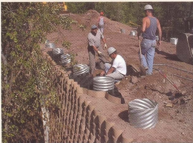
Photo 2: Embedded corrugated steel pipe was installed to facilitate installation of the guardrail posts. The geocell was cut to fit over the steel pipes.