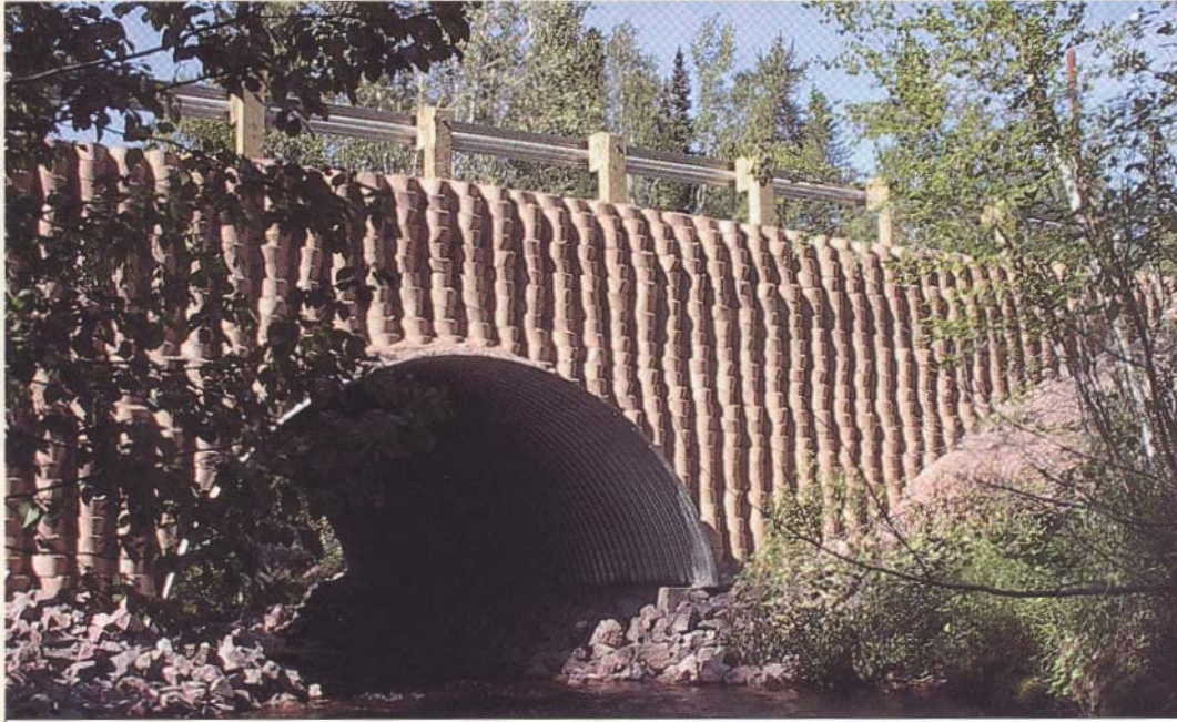
Photo 3: A view of the finished bridge looking upstream. The footings and toe of the wall were rippedrapped to protect them from erosion.

• supply and installation of the guardrail system.