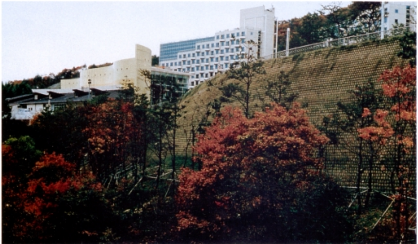
Photo 3. The completed Geoweb® wall measures 200 m (650 ft) in length with heights from 6 - 14 m (20-46 ft).