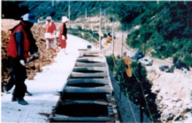
Photo 1. Stretcher frames are used to keep the Geoweb® sections expanded during infilling operations.

Engineer: Unisystems Korea, contact Junsik Kang, Tel 82 374 34 0771