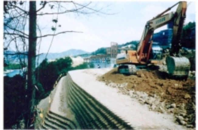
Photo 2. The Geoweb® earth retention structure conforms to tight space constraints and differential settlement.