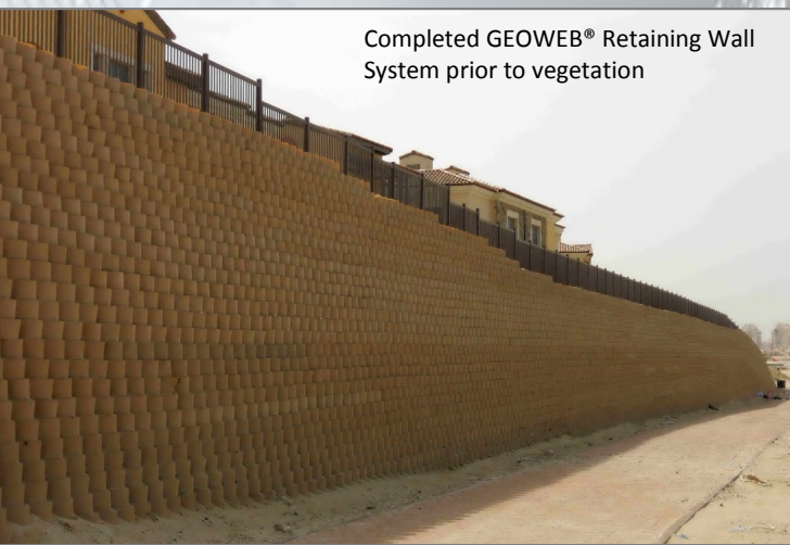
Completed GEOWEB® Retaining Wall System prior to vegetation